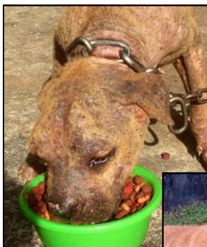
"Cocobay" Rescued July 14, 2013