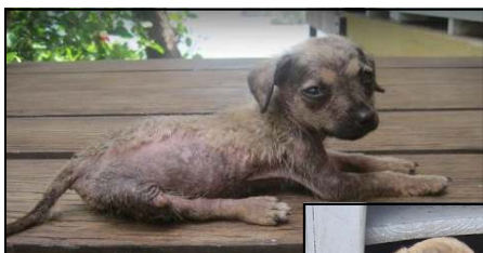
"Molly" Rescued August 23, 2013