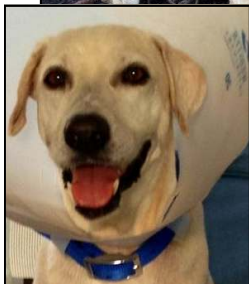
"Bella" Rescued June 16, 2013